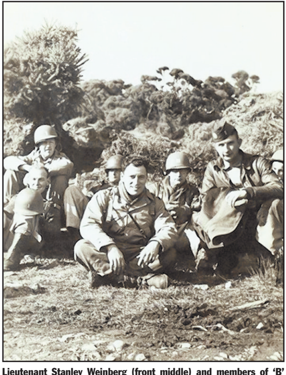
Company, 505th Parachute Infantry Regiment, take a break from ons practice at Ballymultrea firing range, February 1944

HE 505 PIR's firing ranges were located at Ballymultrea, near Ballyronan.