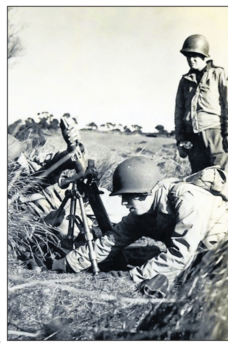
505th Parachute Infantry Regiment troopers fire a mortar on the range at Ballymultrea, near Ballyronan, February 1944.